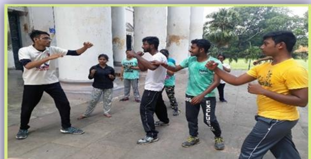
Students undergoing Self-Defence Training

Serampore College has introduced Self-defence Training Programme on 21st August, 2019. Savate Association of West Bengal conducts this Self-Defence Training Programme on every Wednesday from 9 a.m. to 10 a.m. This is a one-year course. In this unique training programme, different techniques are learnt and practised by the students, under the