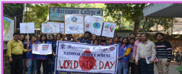
AIDS AWARENESS PROGRAMME CONDUCTED BY NSS

Now, there are four NSS Units (Unit -I, II, III and IV), which can accommodate maximum of four hundred NSS volunteers altogether. Any ASC student can join NSS as a volunteer, subject to vacancy. Vacancies are filled up on first-come-first serve basis. To get certificate from the Calcutta University,